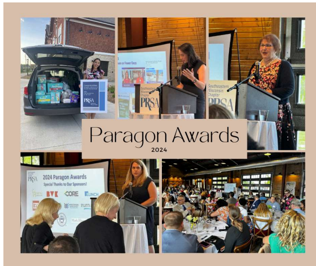
Paragon Awards 2024

President, PRSA Southeastern Wisconsin Chapter